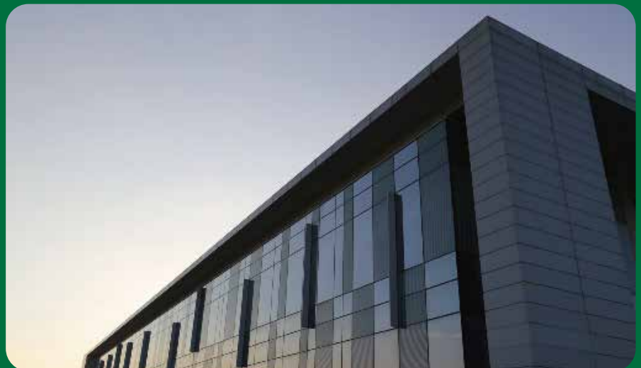
* Duke Kunshan University

The Master of Science in Global Health offers a small, internationally-diverse cohort and unparalleled support from faculty and staff.